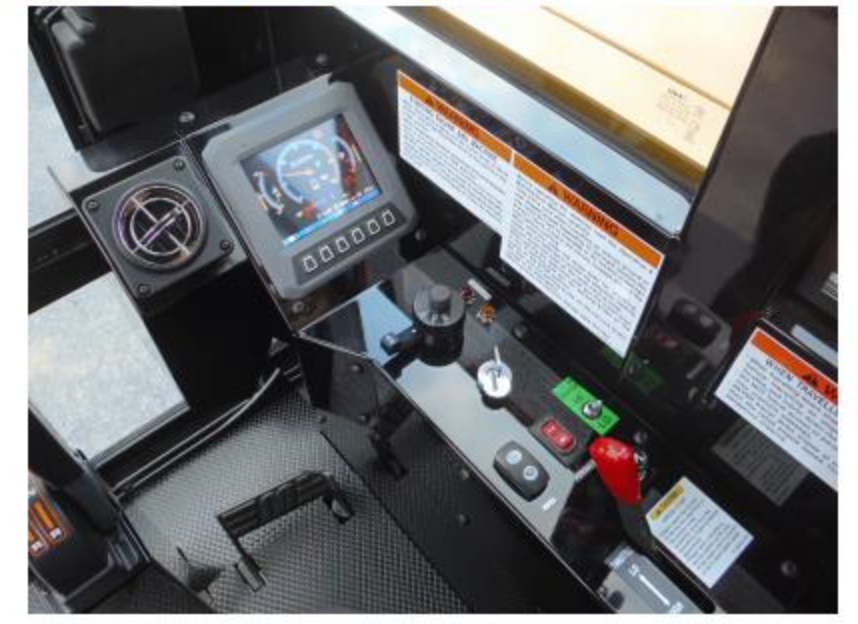
Control panel with LCD screen