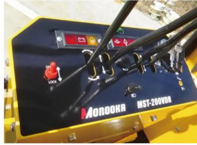
User friendly maneuverability