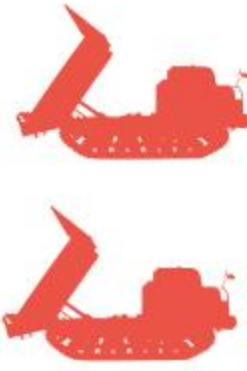
Easy Control with HST drive system