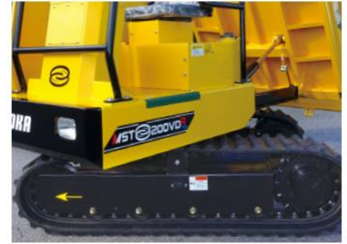
Tough Morooka Rubber track to reduce noise and vibrations