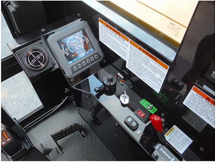
Control panel with LCD screen