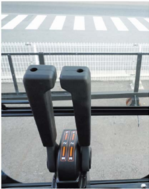
Two driving lever