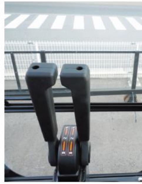
Two driving lever